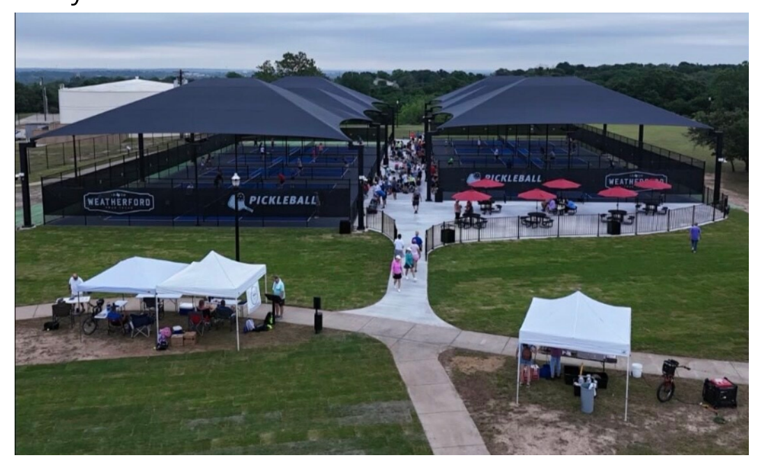
Not our exact design but similar

A committee is coming together to brainstorm additional fundraising ideas. Do you want to take part in the future of the club? If so, join us in ensuring this first project of the club's long-term Grand Vision is a success. We can assure you that you will have fun along the way. Let's do this!