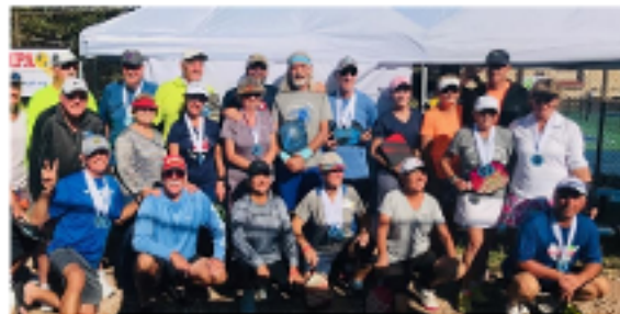
Sun City Texas Circle of Champions at the Horseshoe Bay Senior Open, October 2019.

Check out the descriptions of these options at www.mattlazpickleball.com