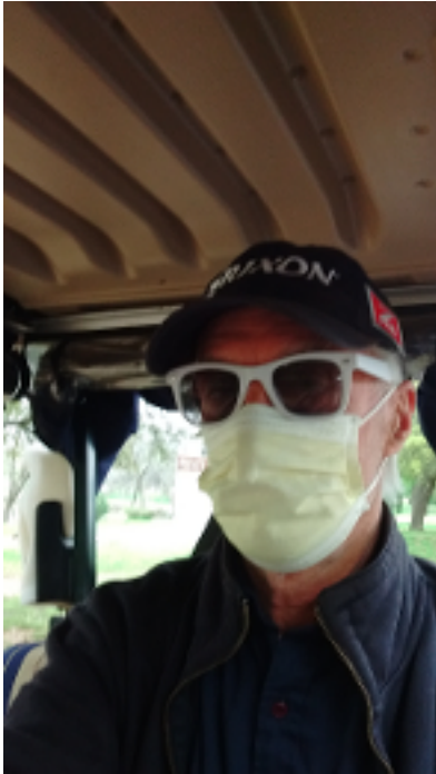
Guess who went to the courts but couldn't find any players?