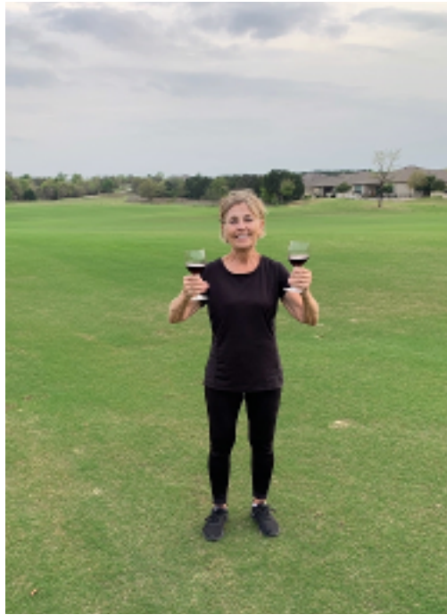
They just said "No golfing." No one said not to drink on the golf courses.