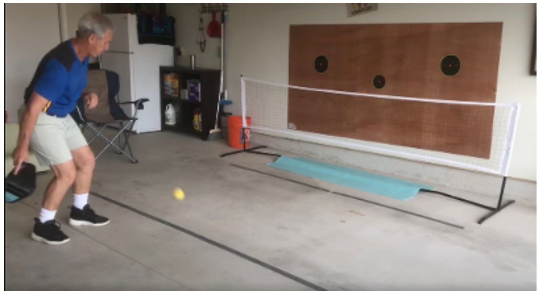
Joe Gray - this garage pickleball practice station is pretty darn nice. You may never come back to real courts. And exactly WHY is your garage so clean?