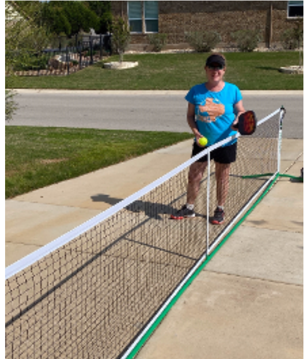
Your Communications Director has more time to "Driveway Dink" without a spring tournament to run, or eblasts to send.