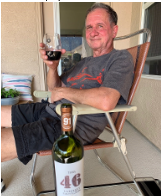
Apparently drinking helps.