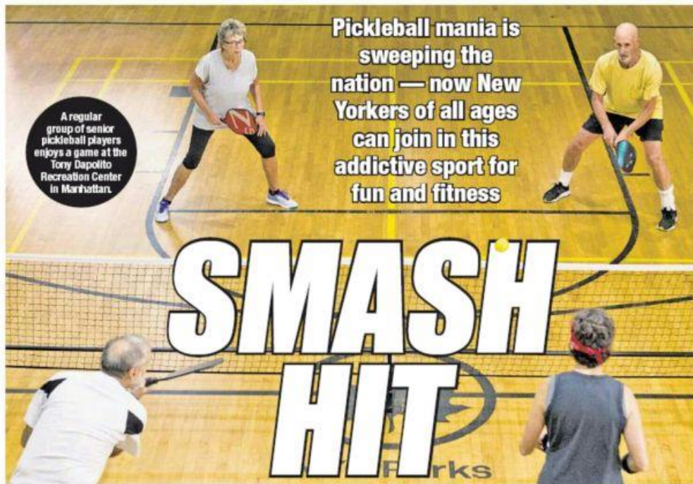
An article in last Tuesday's New York Post reveals pickleball has spread its tentacles across the country and captured the hearts of New Yorkers. If you'd like to read the article, click on Pickleball Article in NY Post .

New York Post Tuesday, October 18, 2016 nypost.com