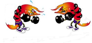
Sun City Showdown

“Sun City Showdown” Pickleball Tournament and Shrimp Boil – Saturday, 5 November 2016. While the registration window for this Saturday’s pickleball tournament and shrimp boil dinner is now closed, here are some important administrative notes for participants in one or both events.