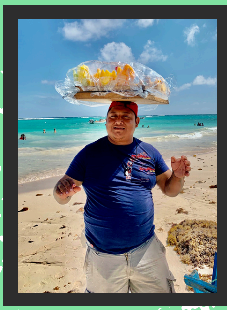
Man selling fruit at XpuHa Beach