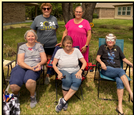
N64 ECLIPSE VIWING PARTY