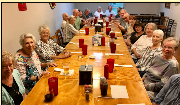
N64 Diners - Party of 20