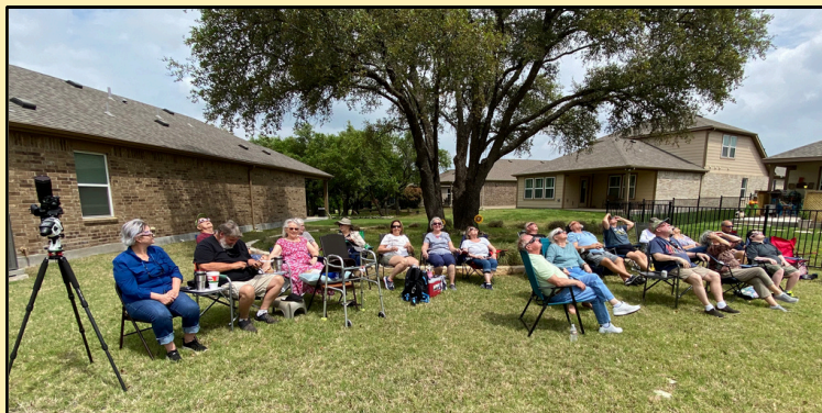
N64 ECLIPSE VIEWING PARTY April 8, 2024