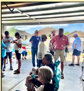
"WHERE'S WALDO?" Monthly Neighborhood Get Together