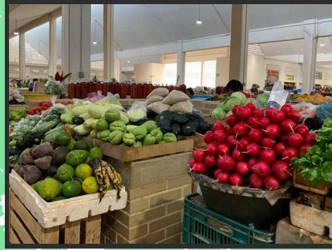
Fruit stalls at the market in the colonial city of Valladolid