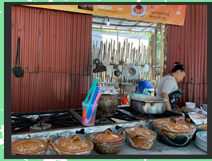
Roadside taco stand outside Tulum where Carol had lunch on a "ladies day out"