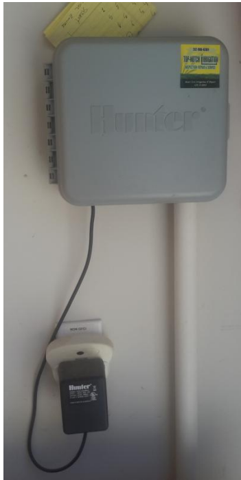
Hunter Pro-C Model 300