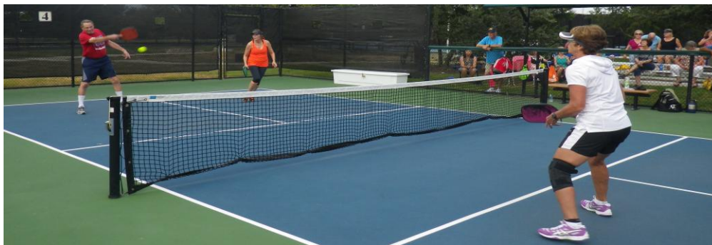
Proof that besides socializing and eating watermelon they really did play some pickleball.