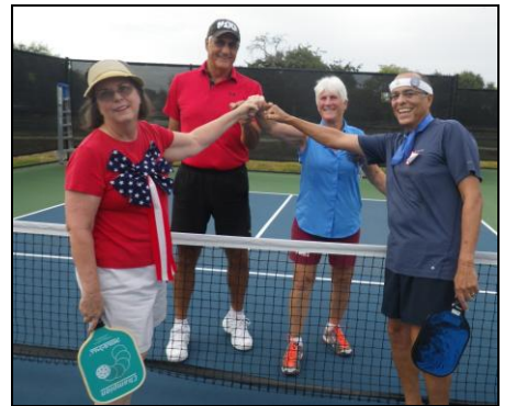
Official pickleball high-five.