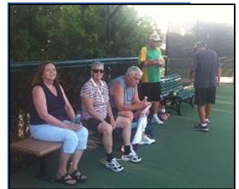
Players and spectators wait in the shade for the next game to begin.