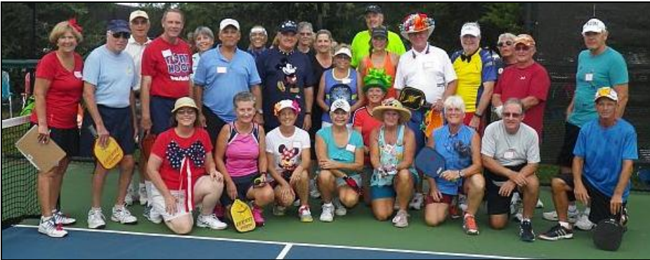
Group mug shot at Buttons and Bows.

It is a rare occasion when you see nearly as many spectators as players down at the pickleball courts. That was the case last Tuesday night, when the Club sponsored a Mixed Doubles “Buttons and Bows” mini tournament and social. Each man drew the name of a woman and the two were paired to play a game to 8 points using Rally Scoring. The men then rotated partners until they had played with every woman. The event turned out to be a great social experience, while giving the participants an appreciation of how fast a game can be completed under the Rally Scoring System (hmmm). View more pictures of this event on the Club's website.