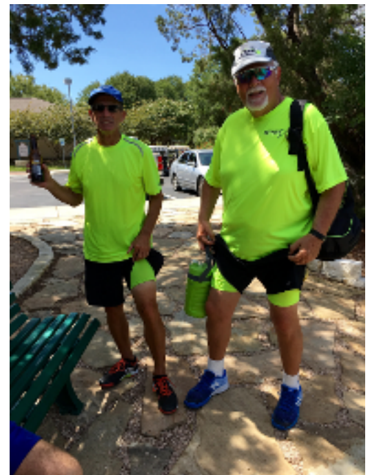
Just one question - where did they find these pickleball "onesies?"

Otherwise it's best to just keep those coaching instincts in check and concentrate on your own game.