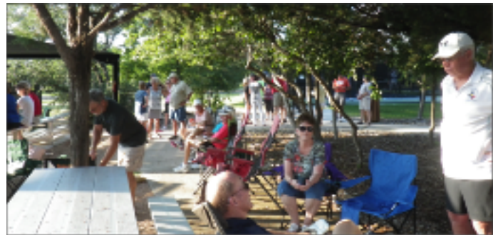
Club members mingle and converse, while others watch pickleball games on the courts.

root beer, 4 cans of whipped cream and an assortment of nuts, syrups, and fruit toppings. Many chose to work off the calories with pickleball, while others just relaxed and enjoyed the relaxing environment and sense of community. Clearly, a smile was found in every scoop of ice cream.