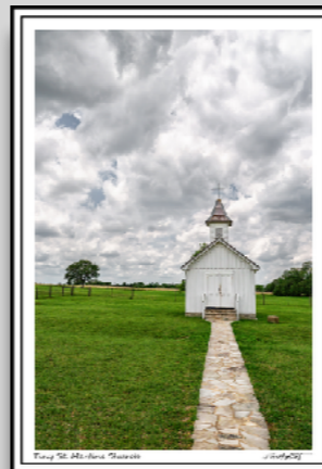
Tiny St. Martin's Church