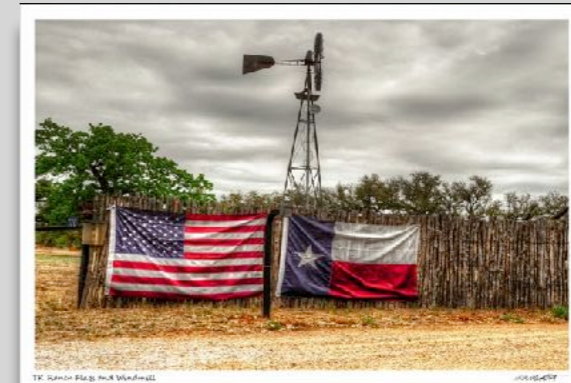
TK Ranch Flags & Windmill

St. David's Healing Arts Gallery inside of St. David's Hospital in Georgetown has a new exhibit! The exhibit opens to the public on Saturday, August 26th and runs through October 20. Twenty club members have contributed 30 images to the "Georgetown and the Hill Country: the places, people, flora and fauna that make this a unique part of Central Texas".