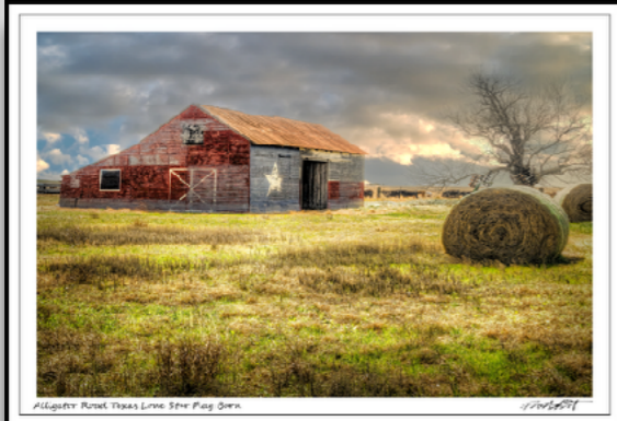
Alligatt Road Texas Lone Star Barn