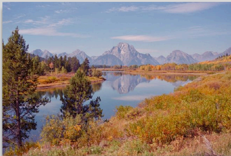
Fall at Oxbow Bend