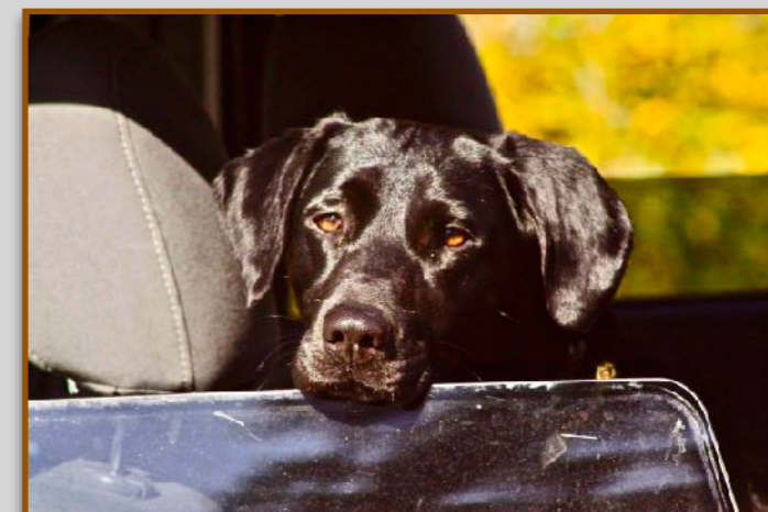
Black Lab Waiting