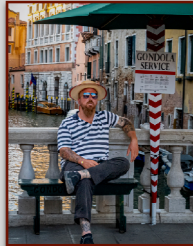
Waiting for a Fare