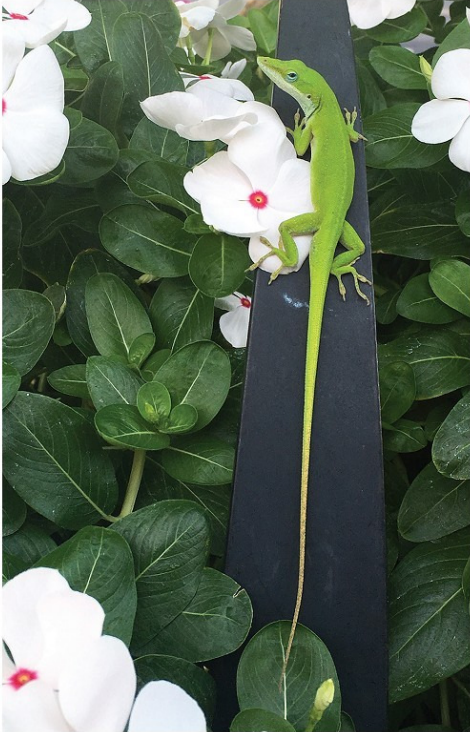
GREEN ANOLE BY TOM QUILTER